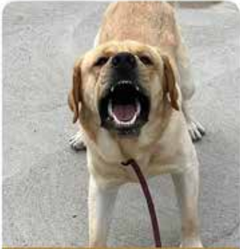
Barking at strangers