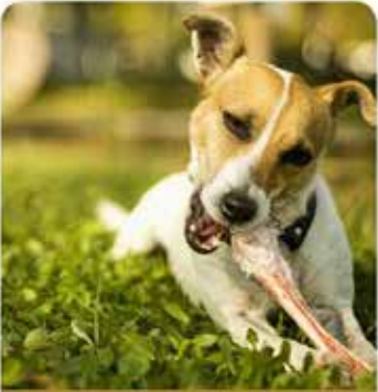
Eating indiscriminately in the wild