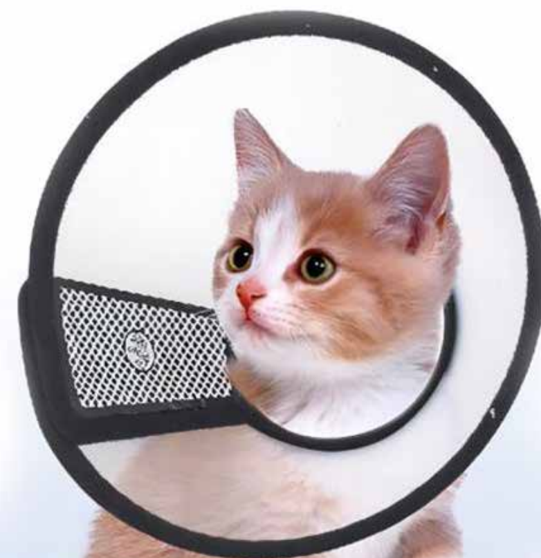
NEC-2+ 34-46cm x 20 cm