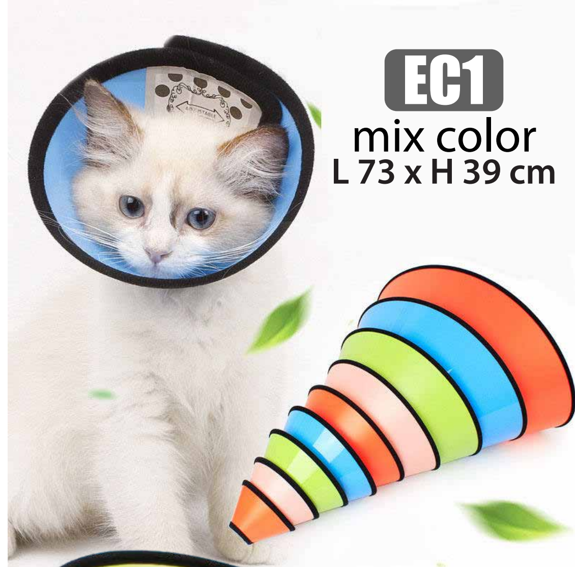
EC1 mix color L 73 x H 39 cm