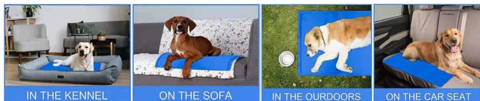
IN THE KENNEL