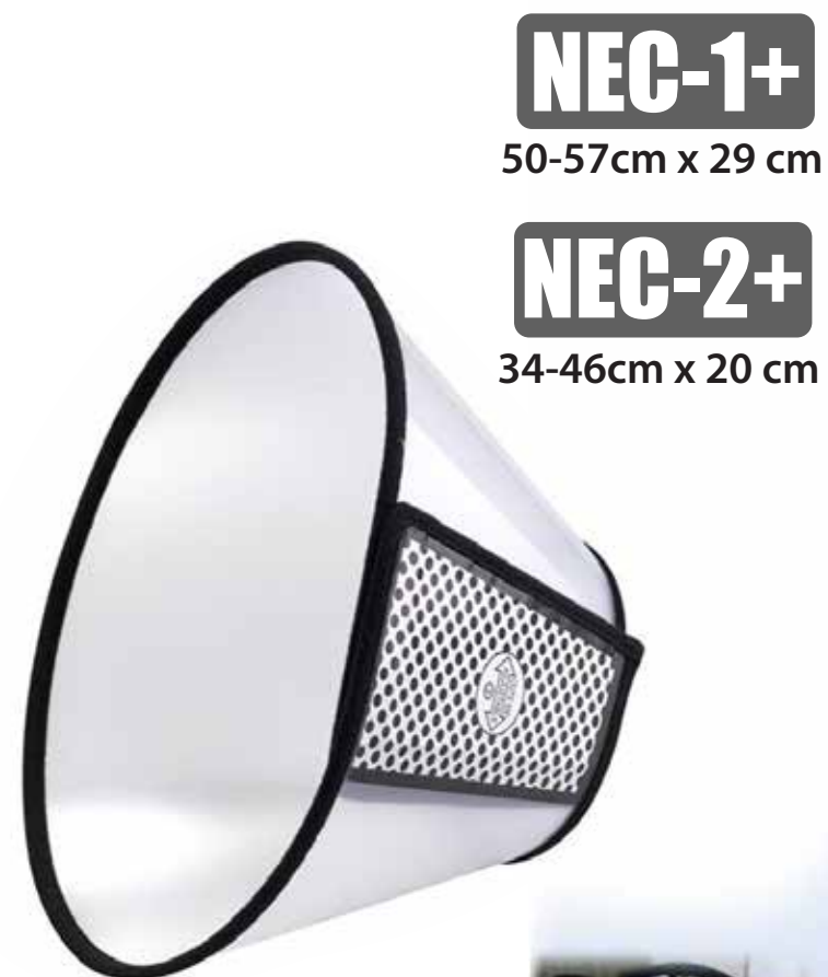
NEC-1+ 50-57cm x 29 cm

Helps protect injuries or wounds from further damage. These collars prevent your pet from licking or chewing at an injury on its body, or from scratching or pawing at its face or head.