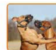
Prevent Fighting Prevent Biting