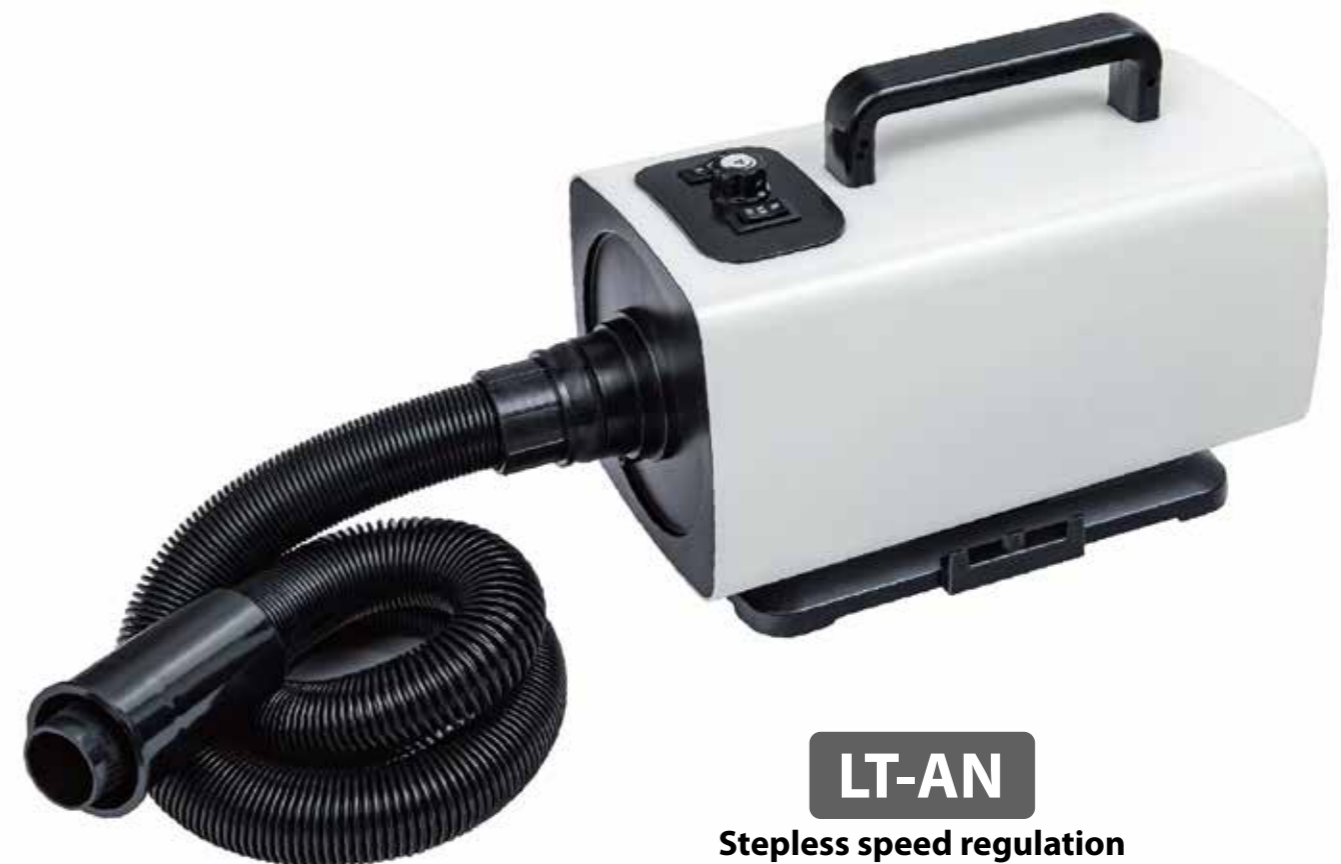
LT-AN Stepless speed regulation

The hair dryer is equipped with an intelligent touch screen control system, making operation much easier. In order for your beloved pet to adapt to the wind speed, there are three automatic acceleration modes, which reach the highest wind speed in 1-3-6 minutes starting from the lowest wind speed. You can also manually adjust the wind speed.