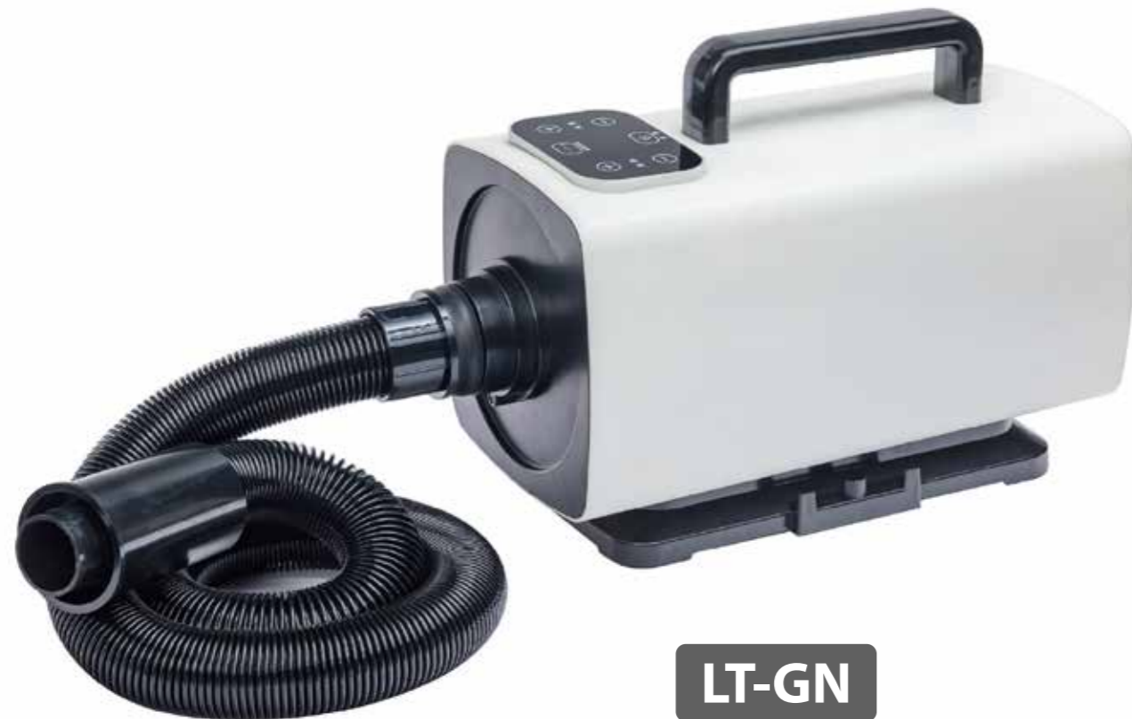
LT-GN Intelligent touch screen control dryer